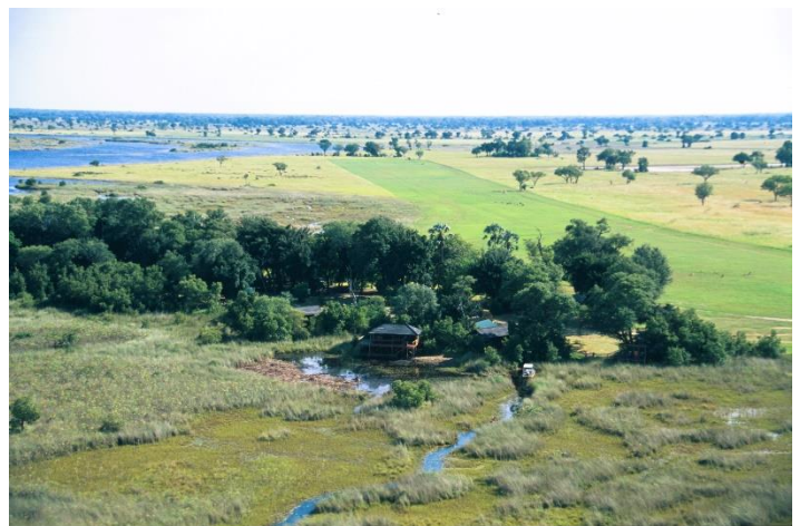
Aerial view Okavango