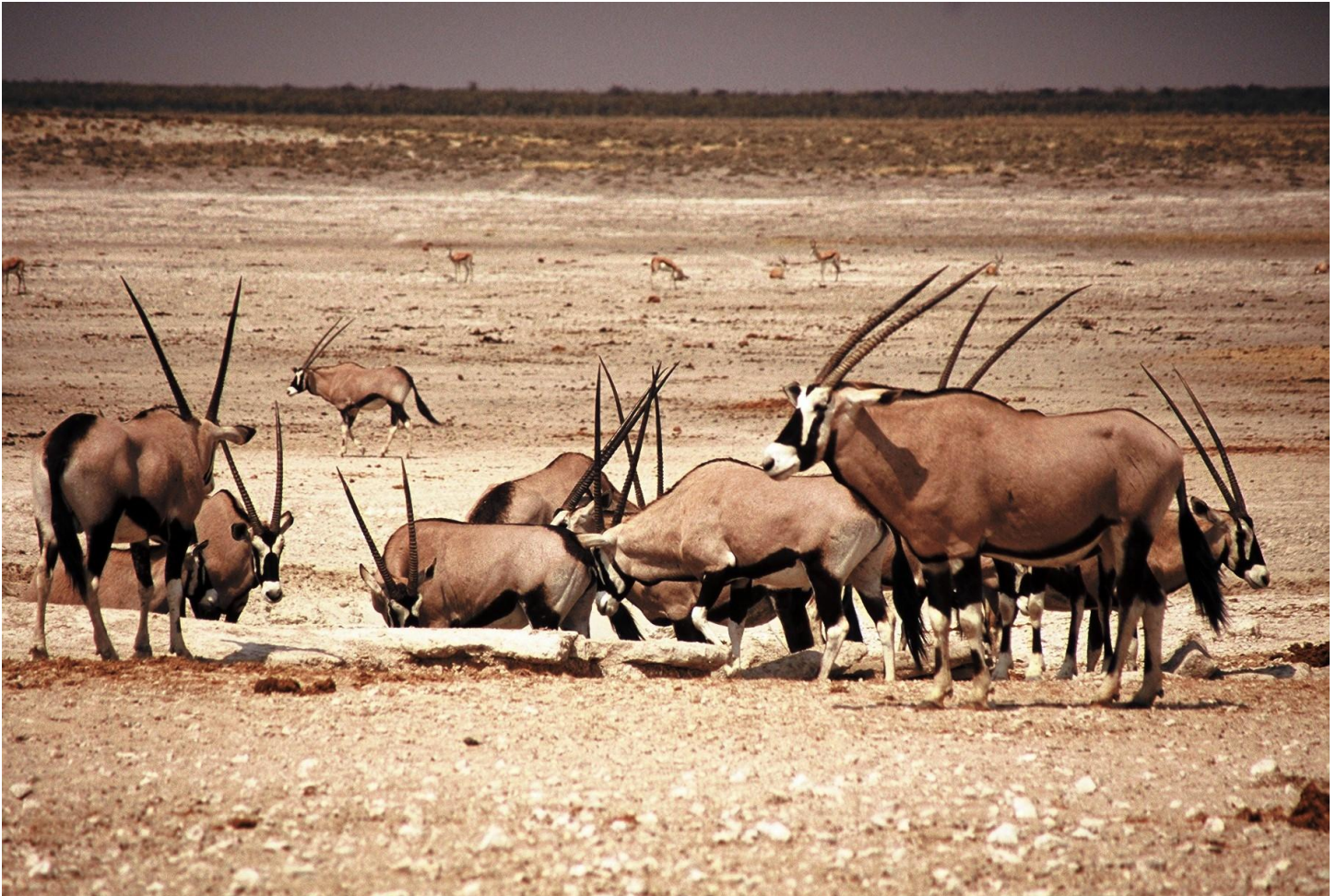
Oryx at waterhole Etosha

Accommodation at Toshari Lodge or similar Driving distance 465 km