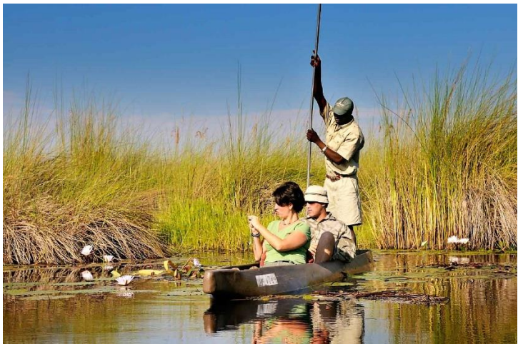
Poling by mokoro

Scenic flight over the Delta (22 min, 45 min, 60 min) must be booked in advance