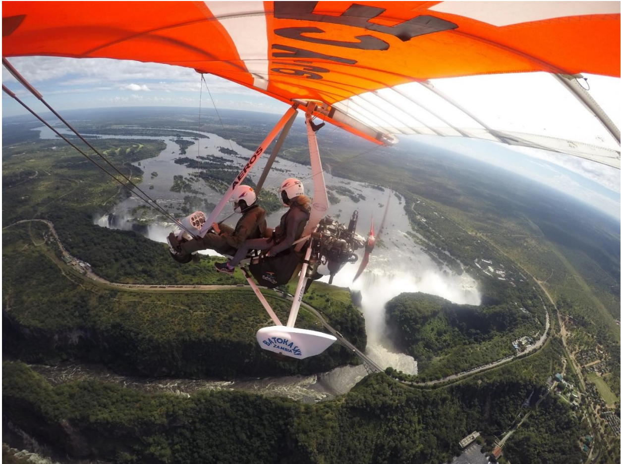
Microlight flight over Victoria Falls

Our safari ends after breakfast, when you will be transferred to Victoria Falls Airport.